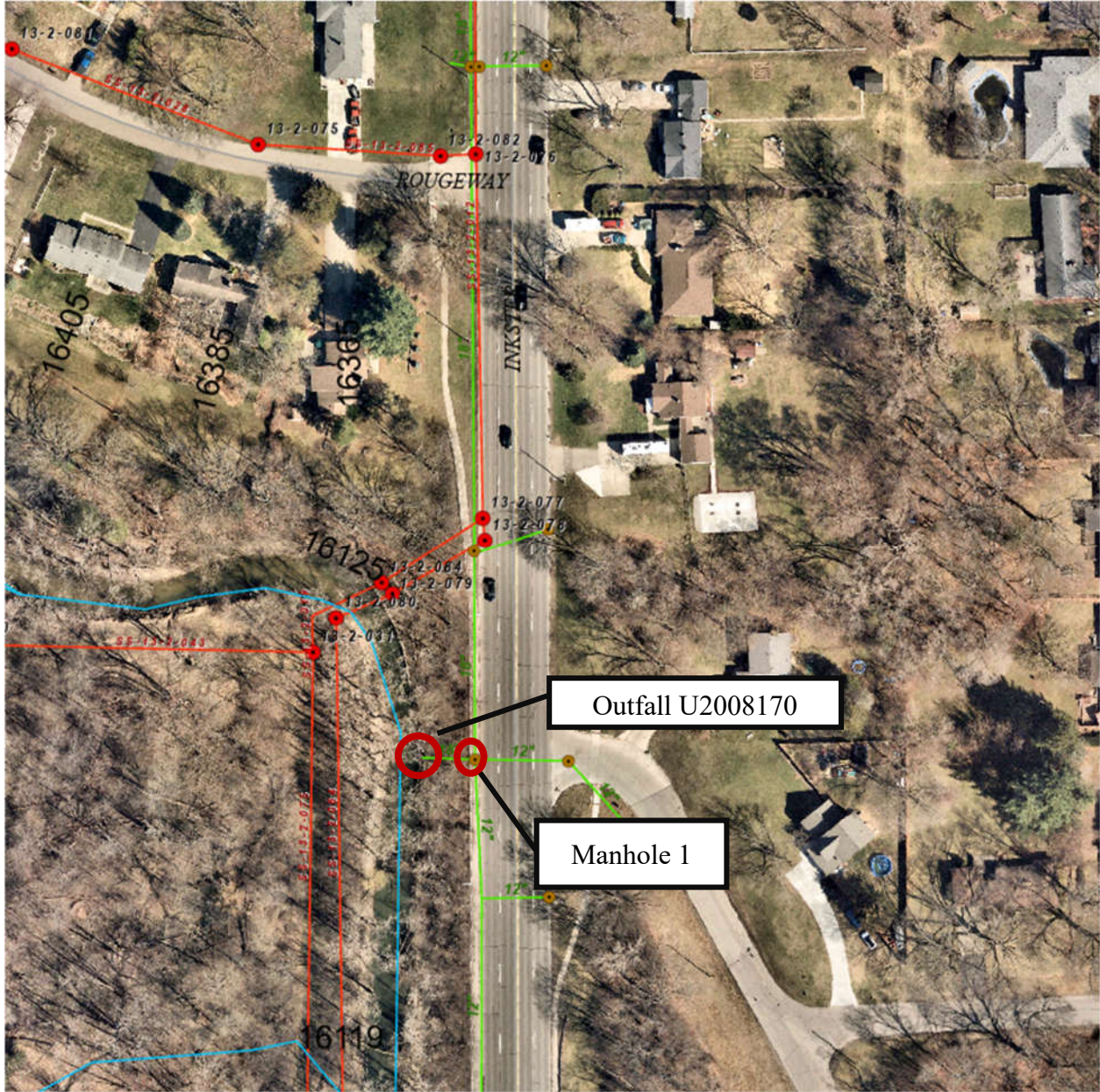
Figure 1. Storm Drain and Sampling Locations