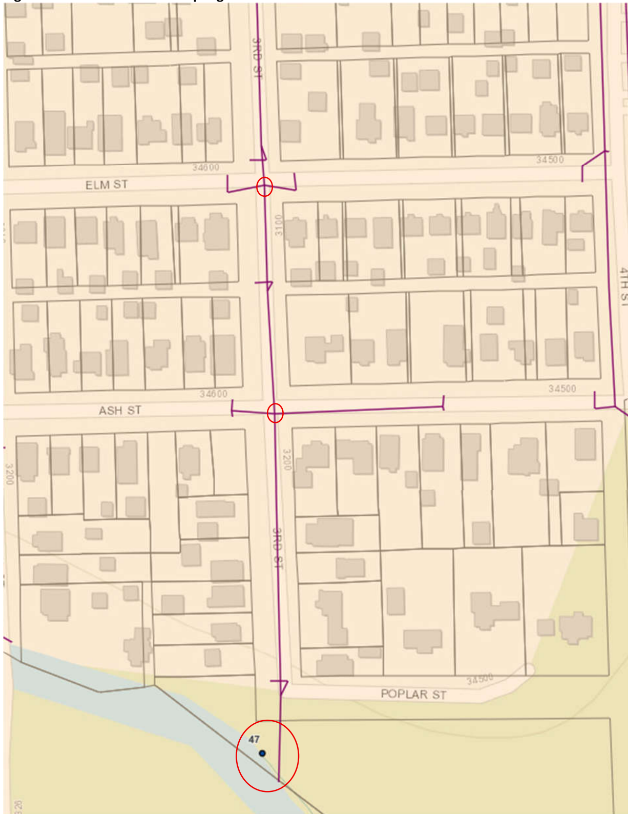
Figure 1. Storm Drain and Sampling Locations

R:\Alliance of Rouge Communities\2025 Alliance of Rouge Communities\Tech Committee\IDEP investigations\Wayne Outfall 36 Report.docx