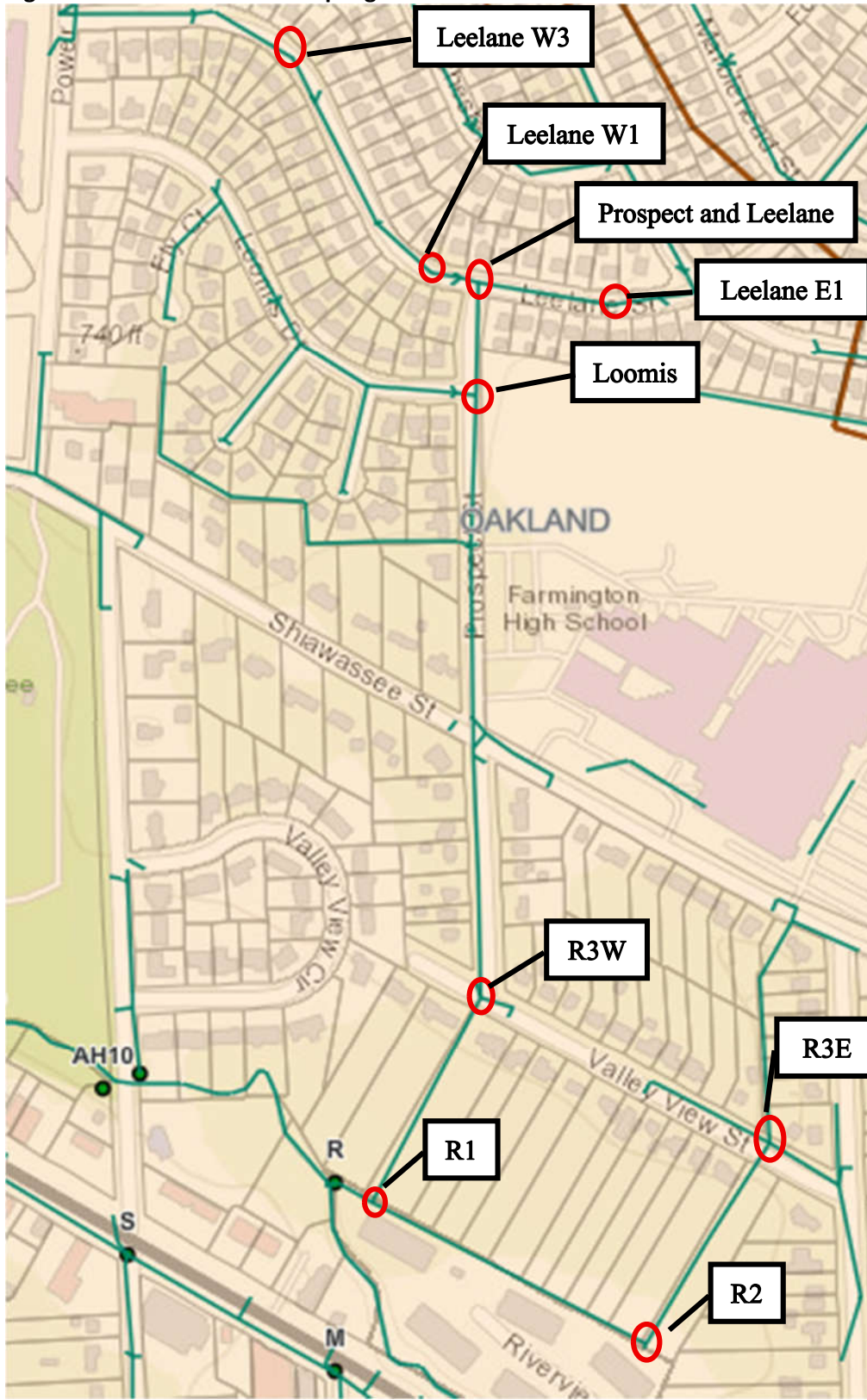
Figure 1. Storm Drain and Sampling Locations