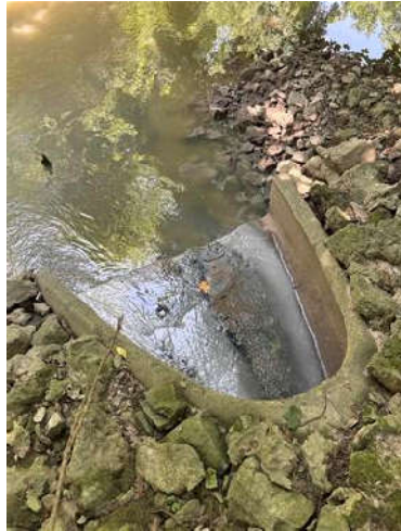
Figure 1: Outfall 51

ARC staff identified a sanitary sewer overflow at outfall 51 in the City of Wayne. This was based on the results from an initial outfall screening which was performed in accordance with the Alliance of Rouge Communities Collaborative IDEP Plan. Initial screening on July 15, 2025, found strong evidence of a sanitary sewer overflow, including strong sanitary odor, sanitary debris, gray colored discharge, and elevated E. coli (Figure 1). This outfall is located near an interceptor on the Rouge Valley Sanitary Sewer System. The Wayne County Department of Public Services Rouge Valley Sewer Team was immediately notified. They were able to identify that a regulator opening was partially clogged with grease, and they removed the blockage that was causing the overflow. A follow-up visit to the outfall on October 23, 2025 found no flow, odor, or signs of illicit discharge, indicating that the problem was adequately addressed. It is recommended that this outfall should be screened annually to ensure that this SSO does not recur.