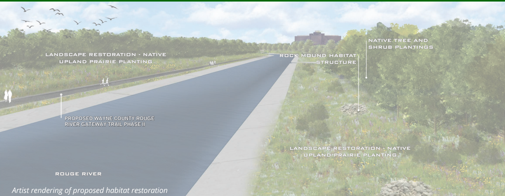
Artist rendering of proposed habitat restoration

This design project is funded by the Bipartisan Infrastructure Law through the framework of the Great Lakes Restoration Initiative (GLRI).