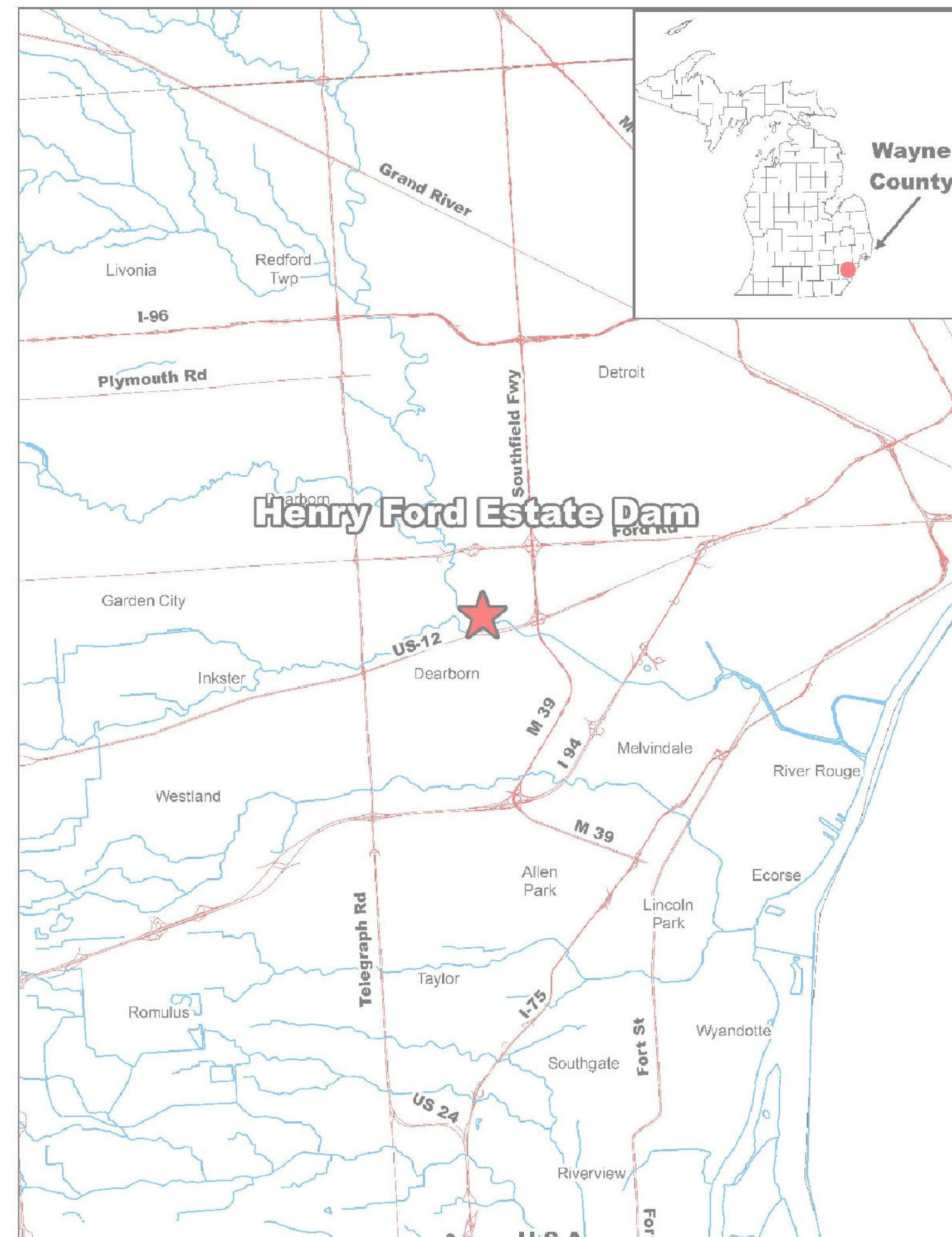
PROJECT LOCATION MAP NOT TO SCALE