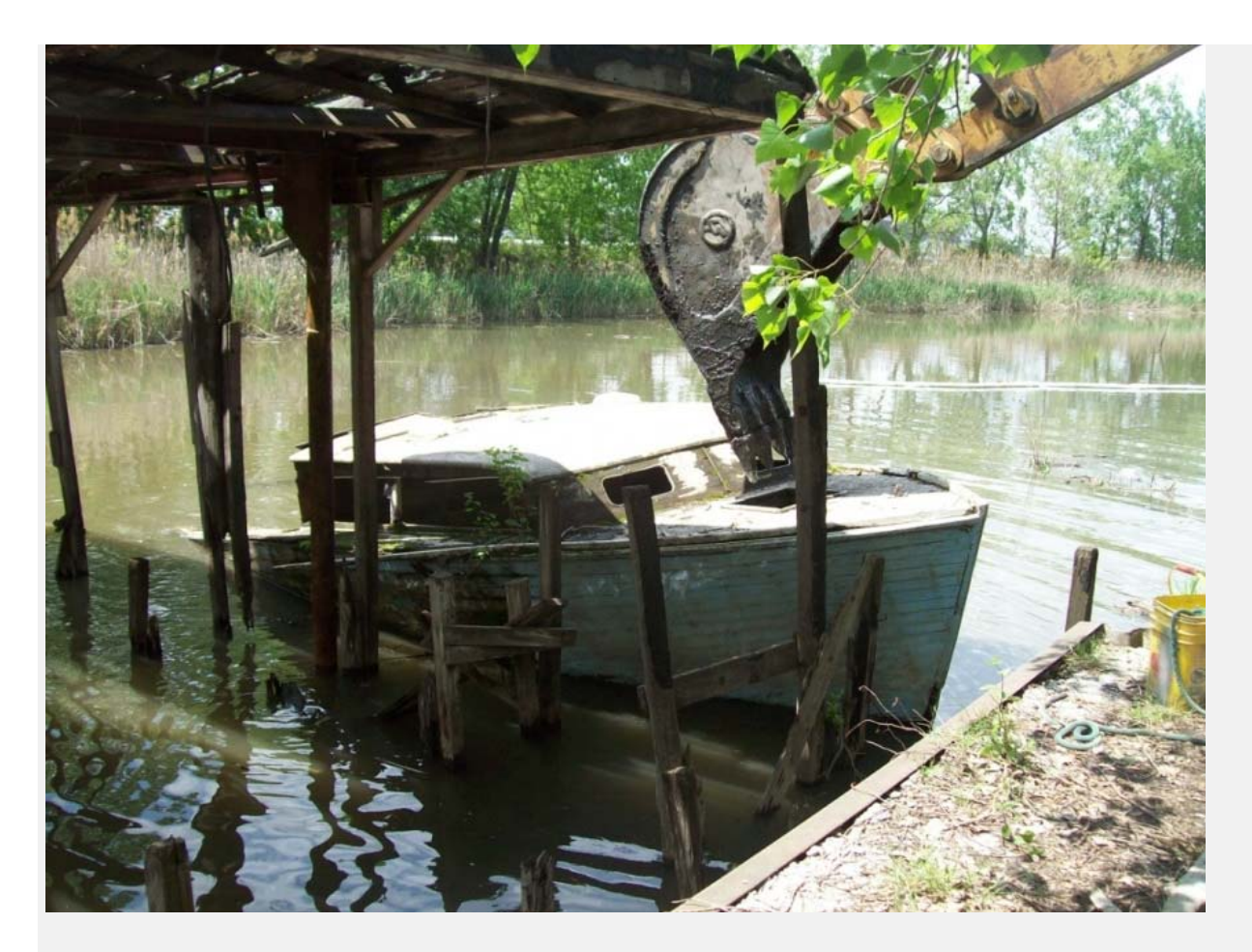
A vessel and former dock structure are removed.

With all proper permits in place, we mobilized to the island in May 2011 to begin removing abandoned vessels from the oxbow channel. After a few weeks, 21 boats were removed from the channel and near-shore area of the island. These boats and other surface debris represented approximately 122 tons of material. The response from the community was overwhelming and five volunteer events were scheduled throughout the summer. Gritty and committed volunteers proceeded to remove over 365-cubic yards of debris scattered throughout the island.