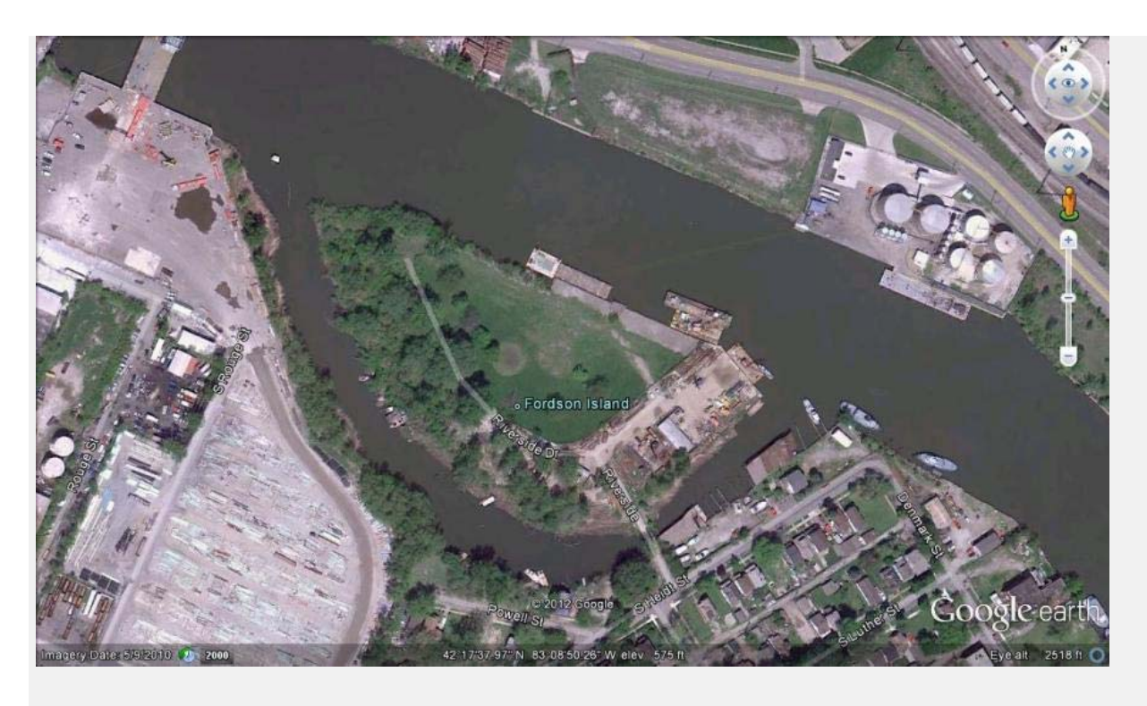
A Google Earth aerial view of Fordson Island. The abandoned vessels are depicted along the southern and western portions of the oxbow channel.

Over time, the reduced flow in the old Rouge River channel slowed and sediment began to accumulate. The shallow water in the channel restricted access, and eventually boats were abandoned. Residents that once called the island home began leaving in the 1970s. The last residential dwellings on the island were demolished by the City of Dearborn in 1989. However, the Fordson Island shoreline remained littered with abandoned derelict boats, a decrepit boat house, pilings, and other debris from former residential structures.